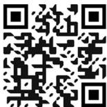
Food Safety English