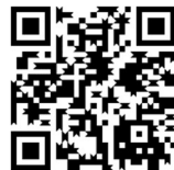
Food Safety Espanol